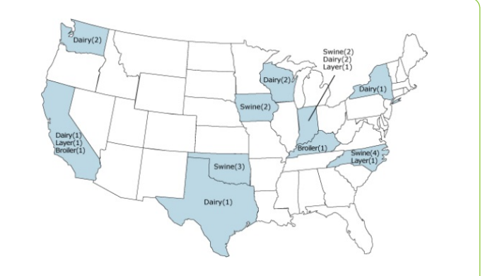
Figure 2: Map of monitoring site locations in the U.S. [107].

Housing: Housing types are critical as they often determine how manure is removed or stored over long periods of time. The National Air Emissions Monitoring Study [107] was funded by the Animal Feeding Operation industry with the Environmental Protection Agency to provide information about emissions of particulate matter, NH<sub>3</sub>, H<sub>2</sub>S, and volatile organic compounds from industries for swine, broilers, laying hens, and dairy cows. Out of 25 sites, only five were poultry farms (3 layers and 2 broilers). The H<sub>2</sub>S emissions data was collected from layer houses in North Carolina, Indiana, Kentucky, and California ( Figure 2 ) [107].