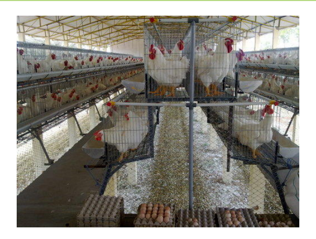
Figure 3: Poultry housing: high rise with reverse stair-step [112].

A more recent study monitored two different types of poultry housing and found that manure-belt housing ( Figure 4 ) [113]was 92% higher in emissions per animal unit (AU) and 78% higher in emissions per hen compared to high-rise houses ( Figure 3 ) [112] ( Table 1 ) [111].