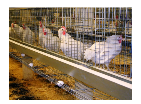
Figure 5: Poultry housing: flat-deck [114].

manure spreader outside of the barn. Barn B was a double-story that had a deep-pit utilizing the lower half as the manure storage. Hens were lined up in three rows of doubly flat-deck cages (Figure 5) [114]. Manure was removed annually by a tractor with a front-end loader. Barn C, like Barn A, was a single-story unit with three levels of stair-step cages. The droppings were scraped from the shallow manure pit monthly to a cross-conveyor and elevated into a manure spreader. The researchers did not detect any H_2S in barn A or C and only 30 ppb from barn B. They noted that this concentration was very low however, workers should be cautious when working in the barns especially during manure clean-out [121].