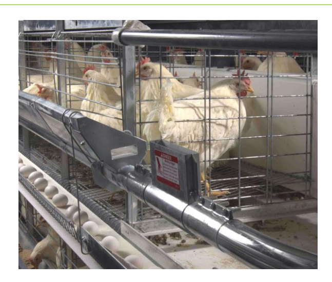
Figure 4: Poultry housing: battery cage with manure-belt [113].

A report on poultry housing in South Korea stated that caged layer houses tend to have the highest levels of \rm NH_3 and \rm H_2S compared to layer houses with manure belts and broiler houses.