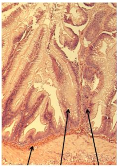
Connective tissue Vacuoles Lamina propria

Figure 3: Distal intestine of rainbow trout receiving 60% bioprocessed soybean meal, and in a low velocity tank.