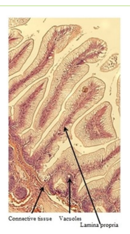
Figure 2: Distal intestine of rainbow trout receiving 0% bioprocessed soybean meal, and in a high velocity tank.

Figure 1: Distal intestine of rainbow trout receiving 0% bioprocessed soybean meal, and in a low velocity tank.