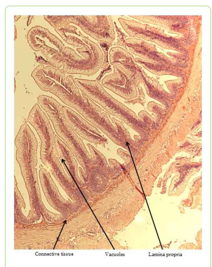
Figure 5: Distal intestine of rainbow trout receiving 85% bioprocessed soybean meal, and in a low velocity tank.

Figure 4: Distal intestine of rainbow trout receiving 60% bioprocessed soybean meal, and in a high velocity tank.